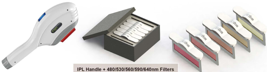
IPL Handle + 480/530/560/590/640nm Filters