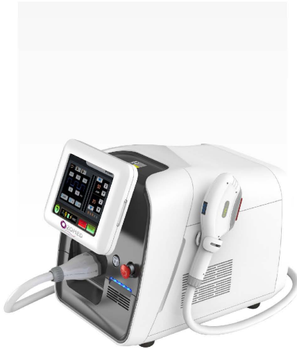
Portable OPT RIVA